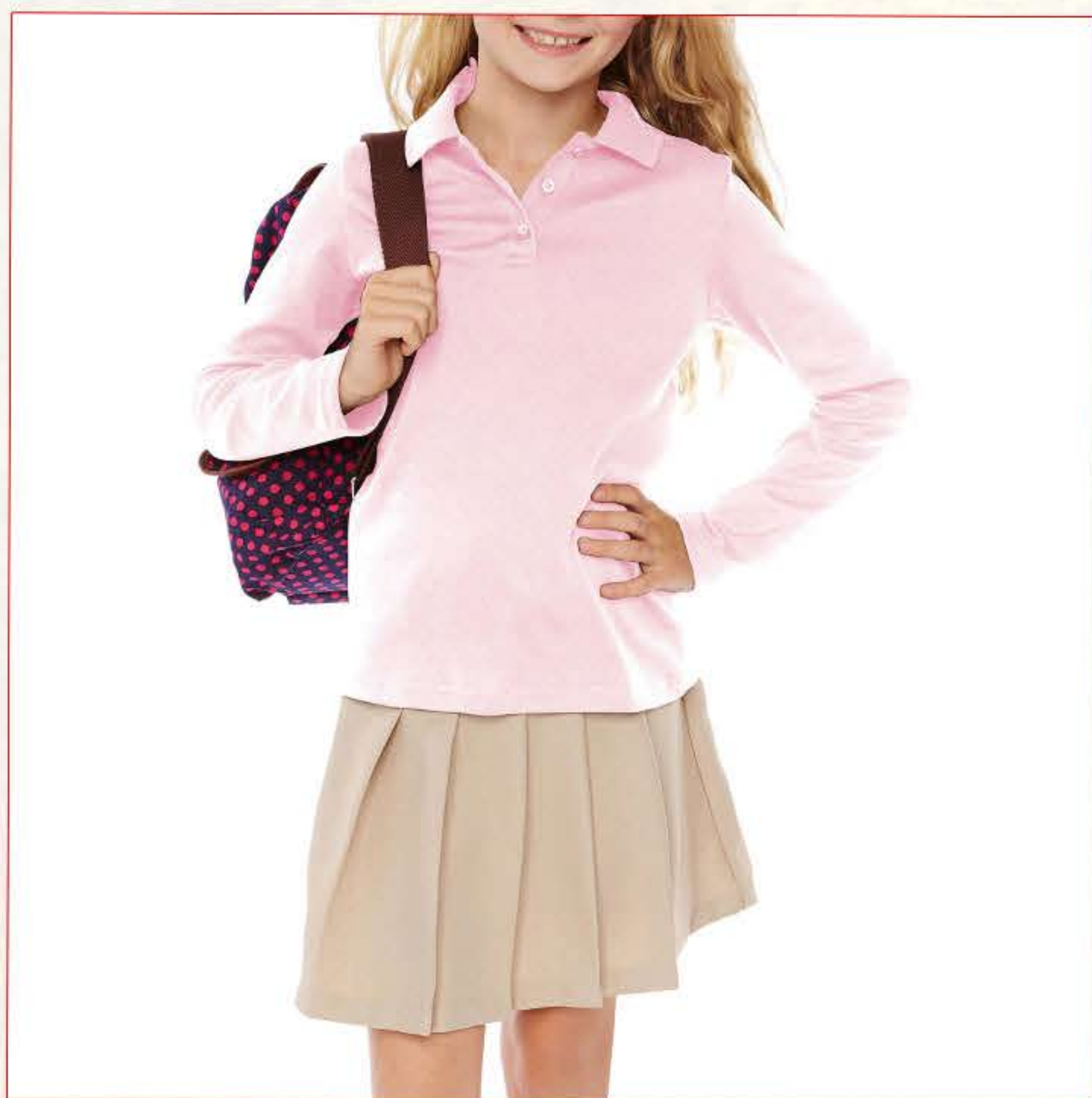
Tops & skirts