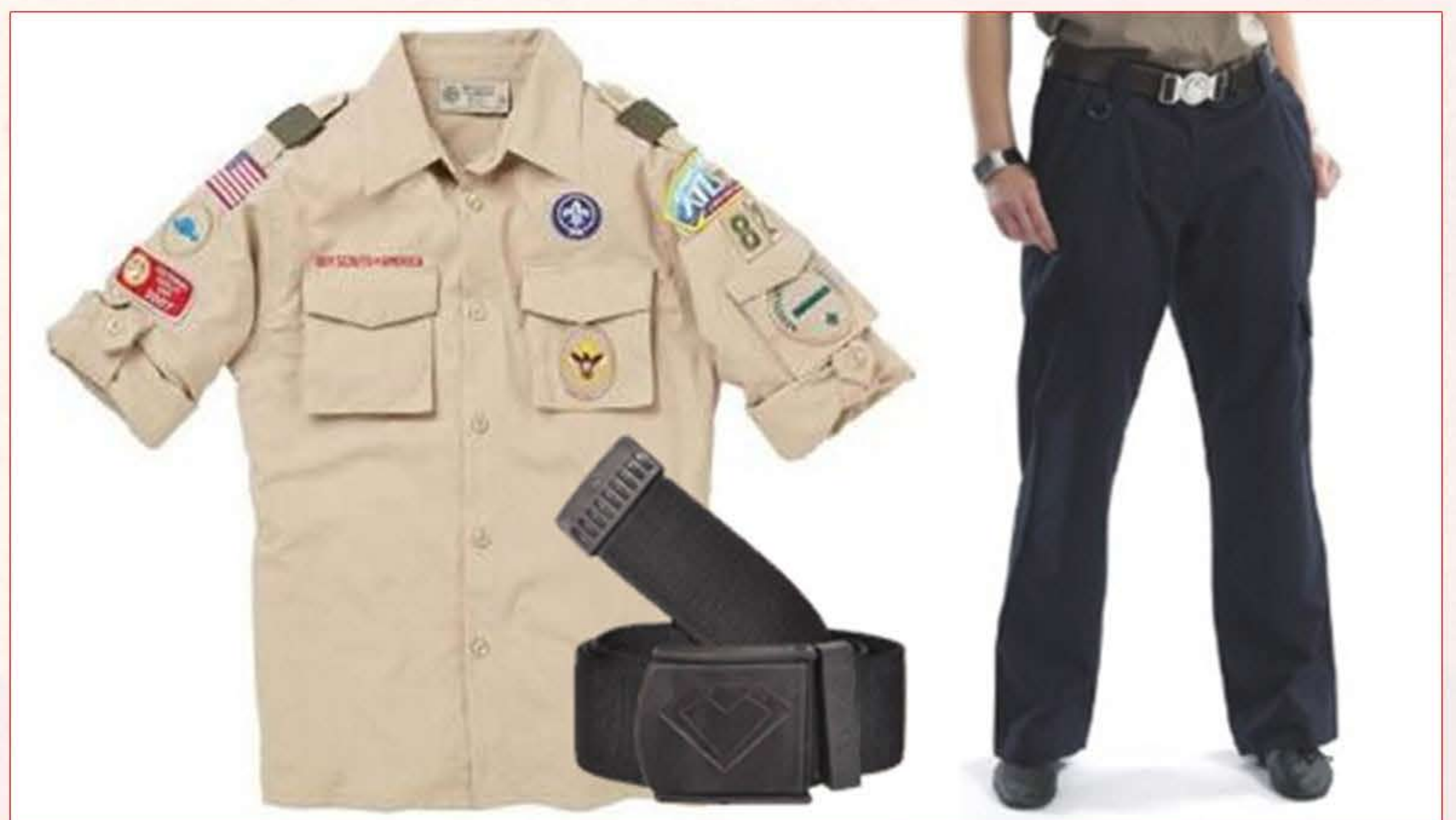
Scouts & guides accessories